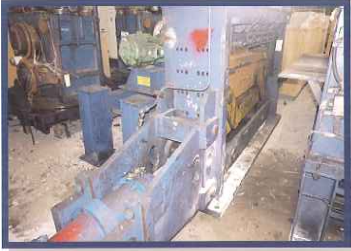
72" Voest Alpine Up Cut Cold Shear with Entry Pinch Roll