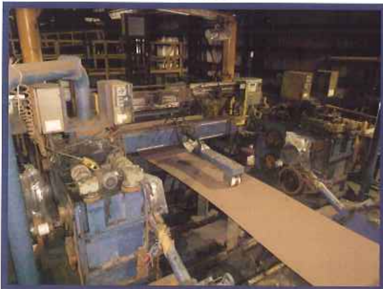
61" Wide Voest Alpine Turret Type Pull Through Side Trimmer with Spare Knives