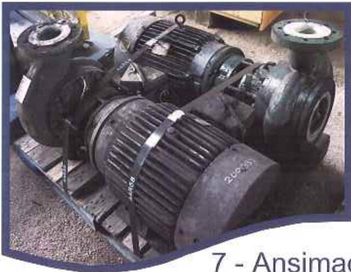
7 - Ansimag KF6410 Pumps 40 HP Motor