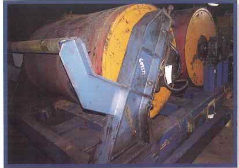
72" Face x 48" Diameter Two Roll Steering Roll Assembly