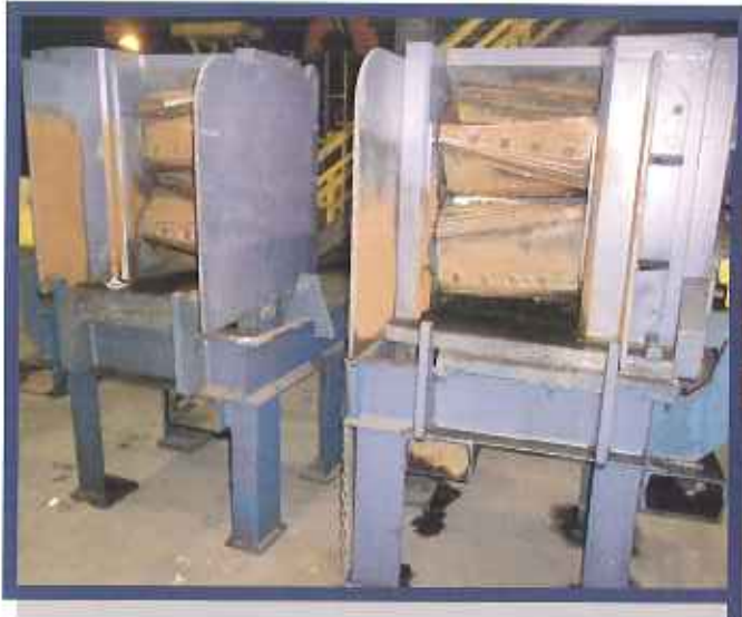
Butech Scrap Chopper with Spare Chopper Heads