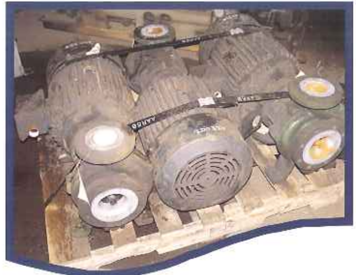
5 - Ansimag K436 Pumps 20 HP Motor