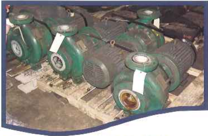
6 - Ansimag KF4310 Pumps 10 HP Motor