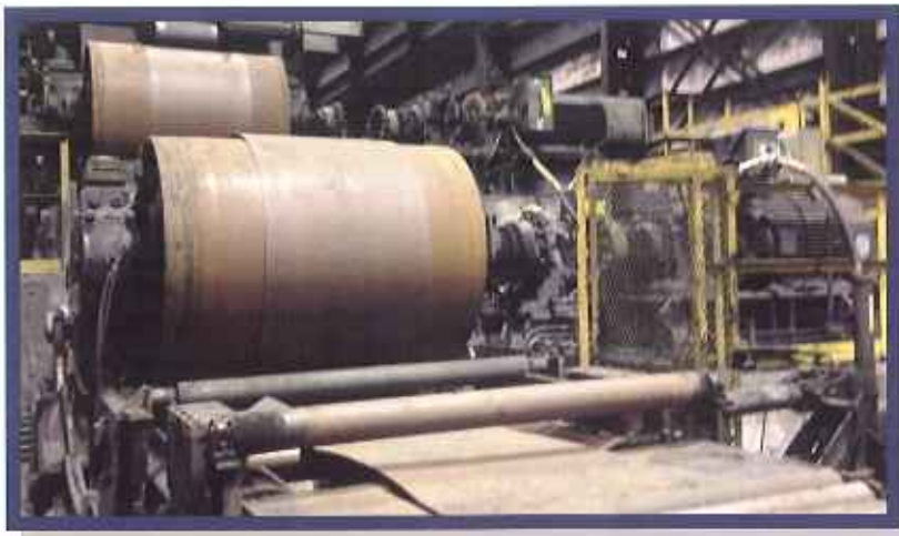
4 - 72" Face x 48" Diameter Two Roll Bridle Roll Assembly